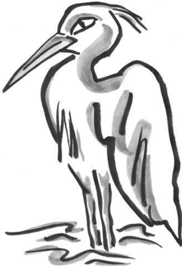
Blue Heron watches

Blue Heron watches Above fast moving water Dreams passing under